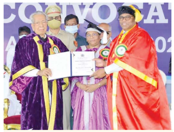
I consider it as a privilege for being conferred the honorary doctorate by Vikrama Simhapuri University.